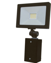
Shown with square junction box