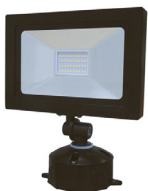
Shown with round junction box